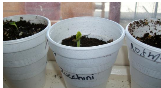
Seed plantings at GIHN

spread the word about the ministry of Goshen Interfaith Hospitality Network. We appreciate the endorsement of Ten Thousand Villages and we are very thankful that Shutterhugs is sponsoring GIHN for the First Friday event.