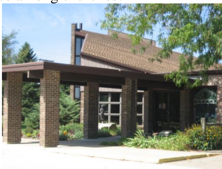
Trinity Lutheran Church